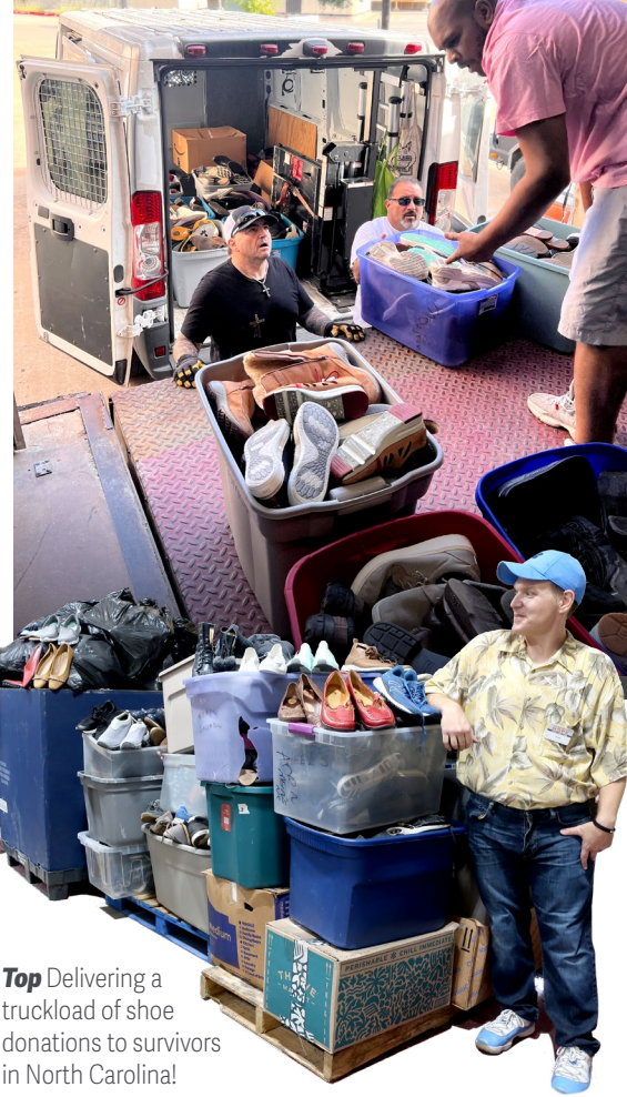
Top Delivering a truckload of shoe donations to survivors in North Carolina!

Together, we can build the Kingdom of God by serving those in crisis and connecting them to the local church. Thank you for continuing to join us through praying, volunteering, and giving to support this vital mission.